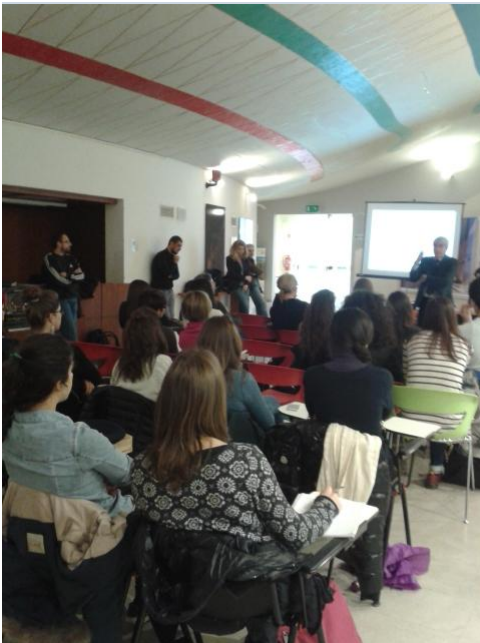
Experimentation starts in Italy, too!