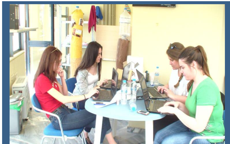
In Greece, employees and volunteers test the didactic tools