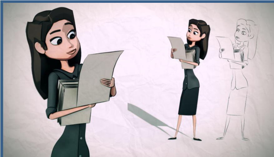
First sketch of one of the 4 characters for the promotional video of ST-ART APP